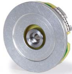
ECI/EBI 1100 series